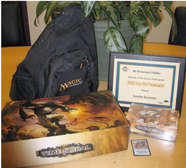
There's quite a collection of goodies available as prizes at Gold Tier Tournaments.

announced City Championships which will award invites to U.S. Nationals and byes to Regionals. But until then, you'll have to be satisfied with the upcoming Gold Tier Tournaments. These are 67 tournaments being held at specified retail locations throughout North America. The events are going to take place Oct. 13-15 and have an array of prizes exclusive to these tournaments. In addition to the usual booster pack prizes – including a box of Time Spiral to the winner – there is an exclusive backpack being awarded to each winner along with a certificate commemorating each winner to be displayed at the site of their victory. Top 8 participants all earn fancy Time Spiral -themed deck boxes, and participants receive a foil Powder Keg (while supplies last).